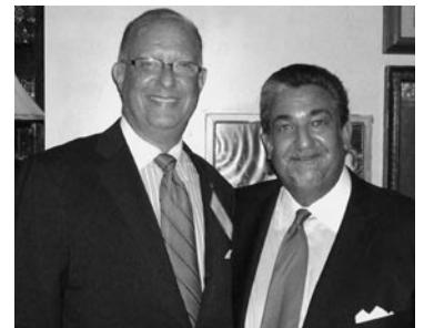
Ron Paul and Ted Leonsis pose at recent Bank event in Tysons Corner.

EagleBank hosted approximately 130 Northern Virginia customers and prospects to an exclusive talk with Washington Capitals and Wizards owner, Ted Leonsis. The luncheon was held at Maggiano's Restaurant in Tysons Corner on June 27th. Ted's shared insights on his life and his many accomplishments provided a lively discussion and interesting perspective on his incredible sports and business successes. He also presented excerpts from his latest book, The Business of Happiness .